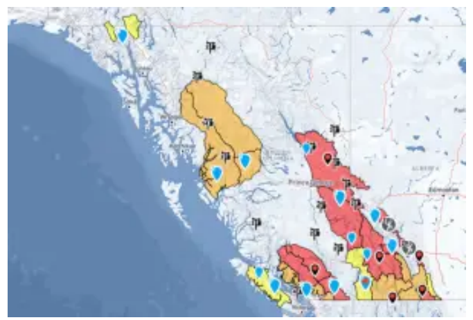
News Avalanche risk high in parts of B.C., Alberta, Yukon ( https://wltribune.com/2026/03/18/avalanche-risk-high-in-parts-of-b-c-alberta-yukon/ )